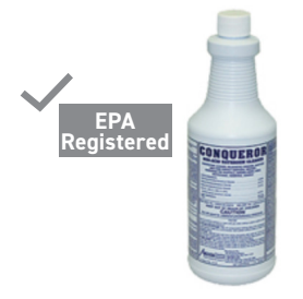
ACS Non-Acid Bathroom Cleaner

Available Sizes: Ready to Use: Qt Concentrates: 1 Gal, 5 Gal Item #DS20SP