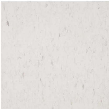
#AL116 - Stark White