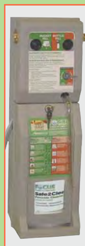
9675 Safe 2 Clean Blend Mate Wall Mounted Dispenser

Three convenient systems for automatic dilution/metering of our cleaners into secondary containers (32 oz. spray bottle or bucket fill) in Ready To Use form. Convenient wall mount units in janitors closets, housekeeping/maintenance rooms, etc. or dispensing gun for portable filling as needed.