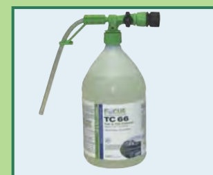
Blend Mate Closed Loop Dilution Gun