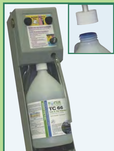
Blend Mate Closed Loop Wall Mounted Dispenser